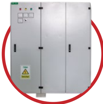
TU up to 6300A.