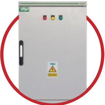
SPACIAL up to 6300A