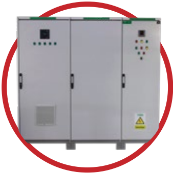
PRISMA IPM up to 4000A

TEBA UNITED is a Schneider Electric certified Prisma Panel builder. We provide all Schneider Electric Panel products & Services that cover Design, Install, Consult, troubleshoot, Selectivity and short circuit studies.