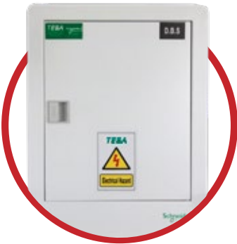
DISBO up to 250A .